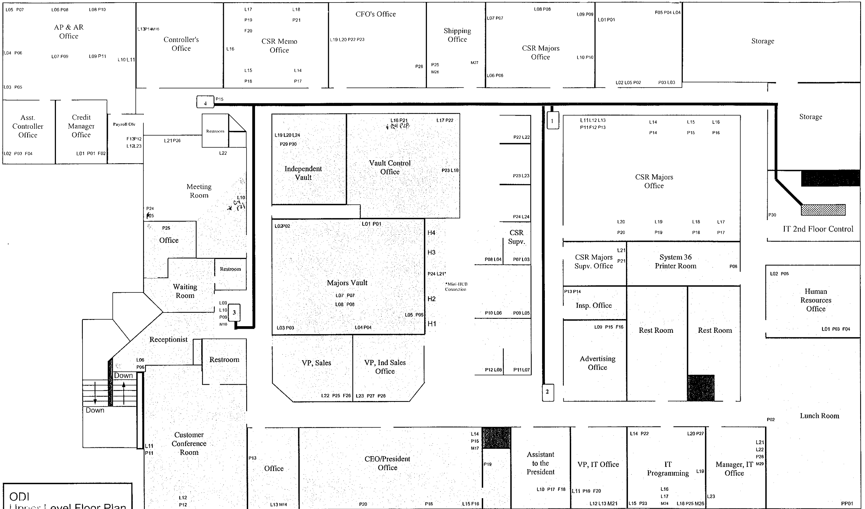
ODI Upper Level Floor Plan